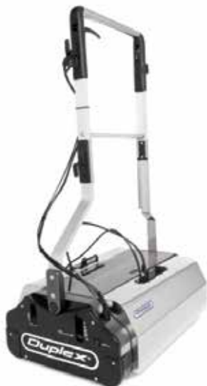
620 Tekna Steam + stainless steel

The new powerful steam jet is directed onto the floor at a high temperature facilitating the removal of even the most stubborn dirt and grease on either smooth or profiled hard flooring without risk to the floor surface. This steam jet washing system is also particularly effective on CARPETS and RUGS etc as it not only washes the carpet fibres but it re-vitalizes them as well with the action of two ROTATING BRUSHES. The new Steam + assures an excellent result on all types of floor and can be used also for GUM REMOVAL.