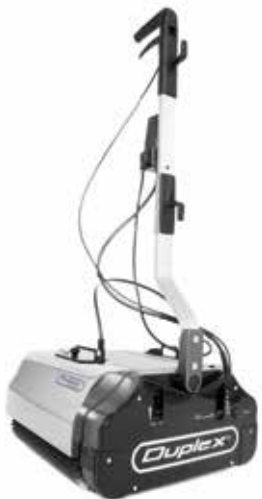
420 Steam + stainless steel